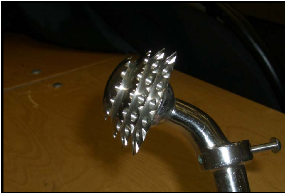
Siwash's THR, 1959